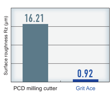
Fig. 4 Surface roughness