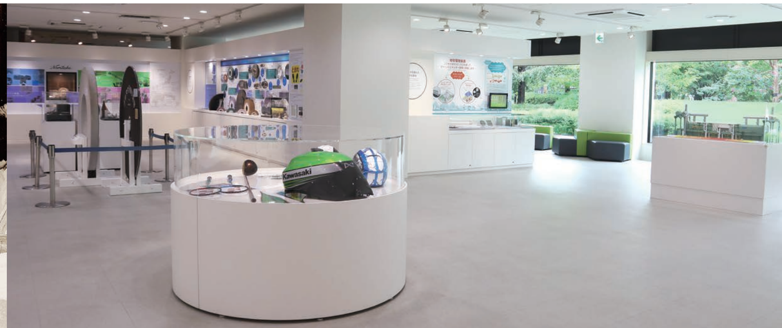
Welcome Center (technology corner)