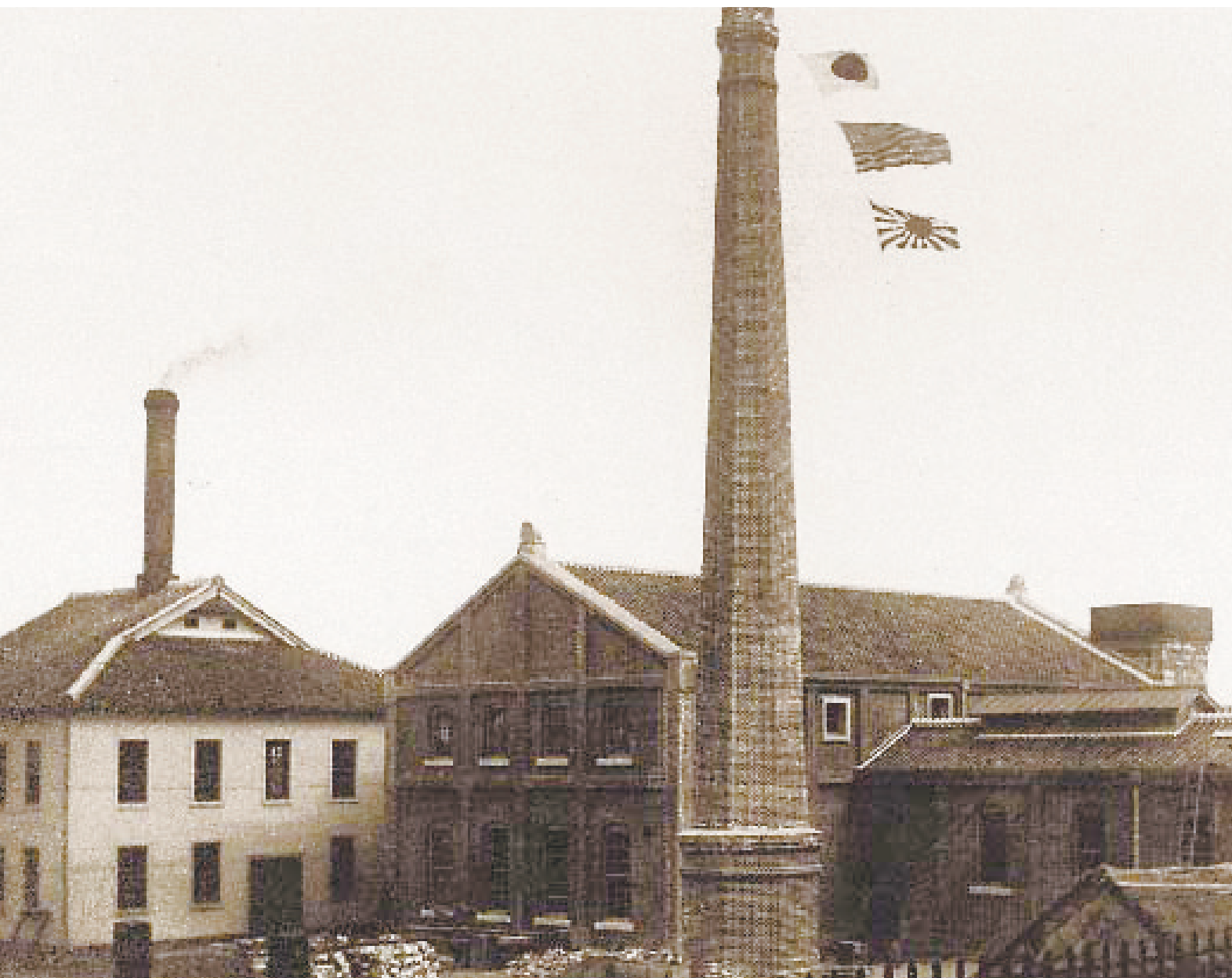
The Headquarters Plant at the company's founding (1904)