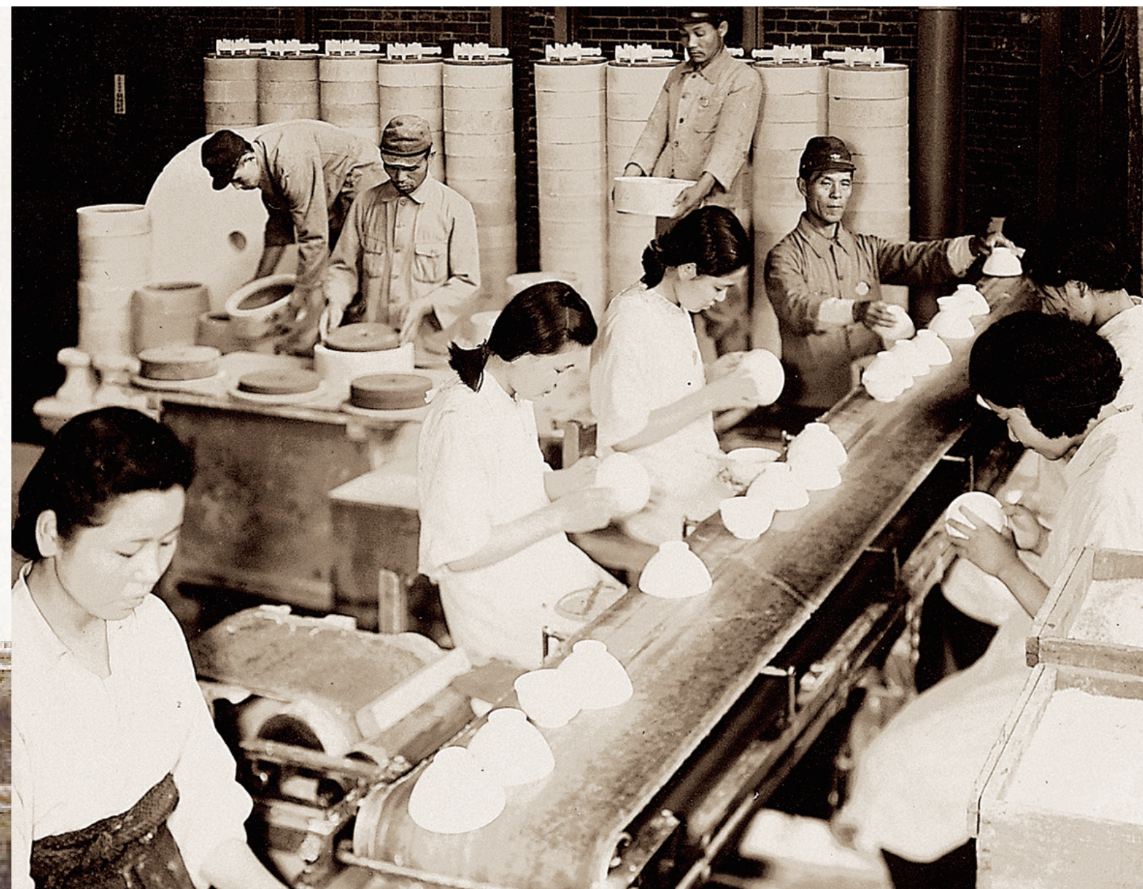
Firing plant for mixed-firing of tableware and grinding wheels (around 1940)