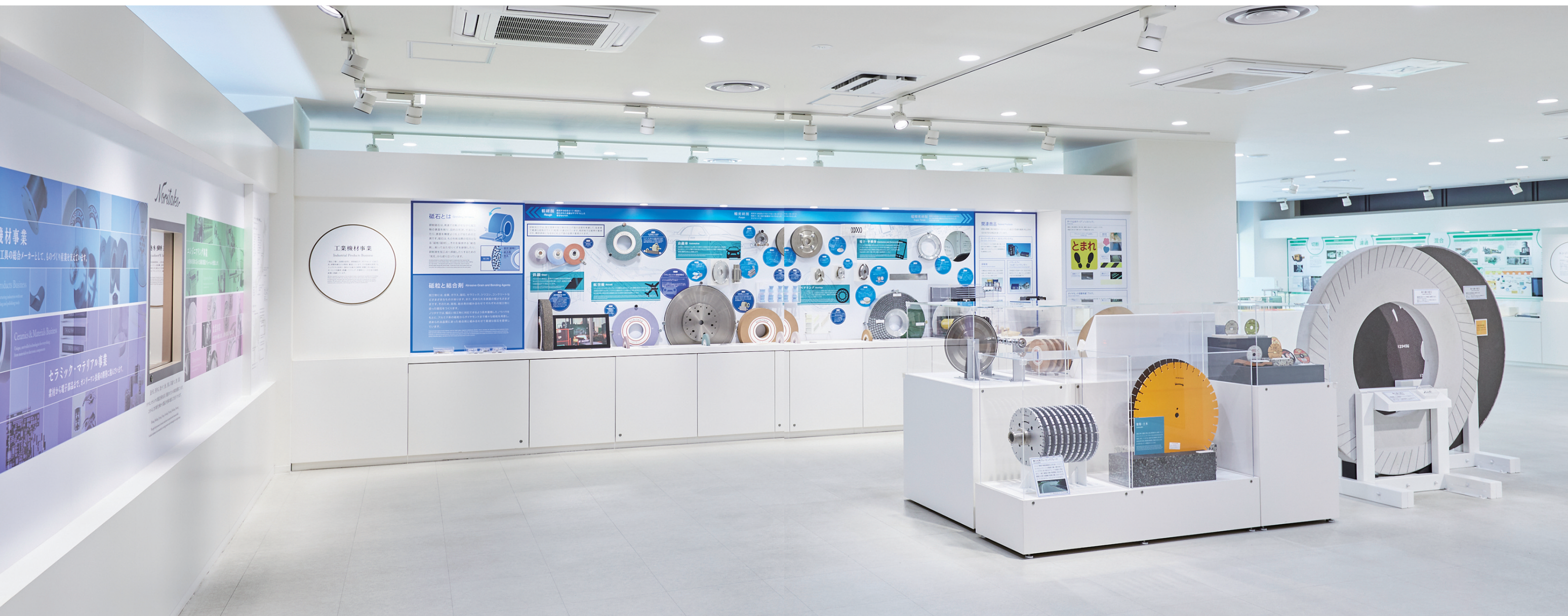
Welcome Center (technology corner)