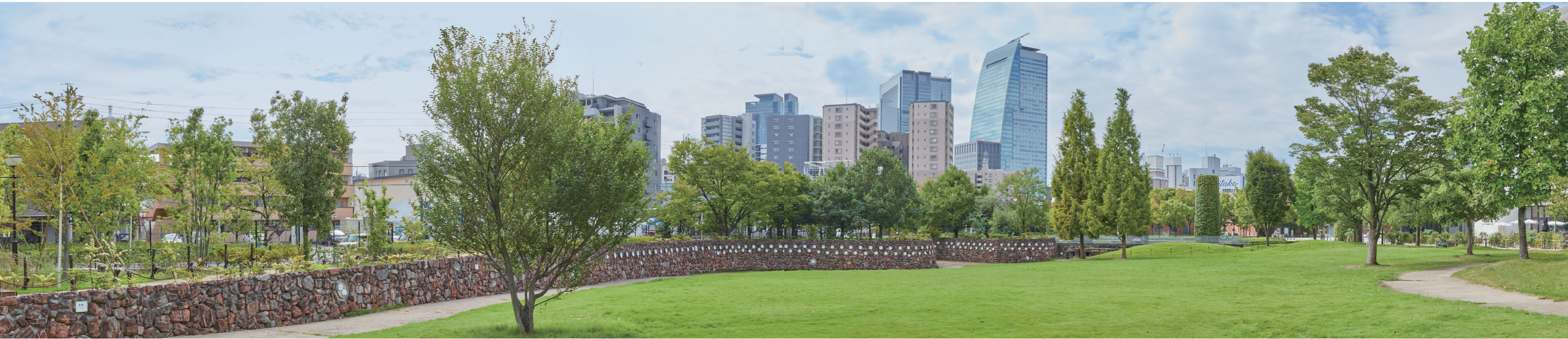
Noritake Garden (Chimney Plaza)