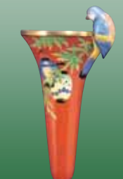
Vase :Porcelain H.8.3in. 1918 ~ 1930