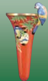
Vase :Porcelain H.8.3in. 1918~1930